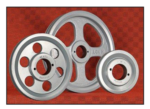
Where a bushed sheave is preferred we offer the AKH & BKH products furnished to accept an H-Bushing. Available in 1 and 2 grooves