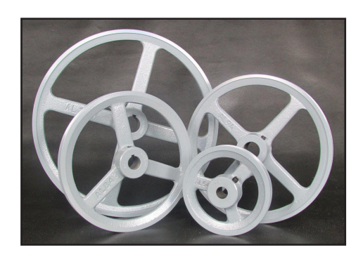
AL Light Duty Sheaves are bored to size and are suitable for fans, air conditioning, and furnace blowers.